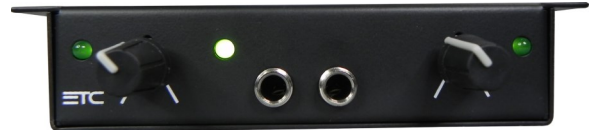
UC-2 Under Counter USB Station

ETC's UC-2 Microphone Accessories are designed to work flawlessly with the UC-2 Under Counter USB Station. FP-115 and HW510 Headsets and BPM-18 Belt Packs also work with the UC-2 but are not shown here.