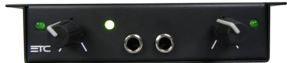
UC-2 Under Counter USB Station

ETC's UC-2 Accessories are designed to work flawlessly with the UC-2 Under Counter USB Station. FP-115 and HW510 Headsets and BPM-18 Belt Packs also work with the UC-2 but are not shown here.