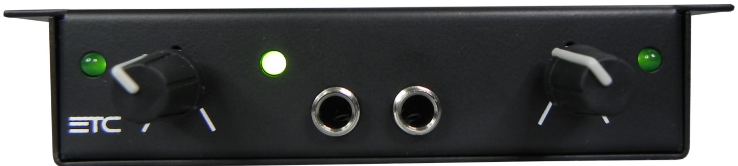
UC-2 Under Counter Headset Jack Box

ETC New USB Programmer App allows User Defined PTT action